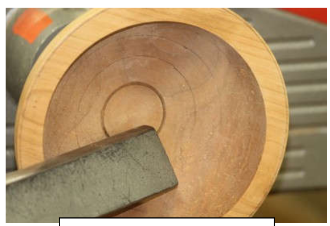
Layout 3/4 to 1 inch increments