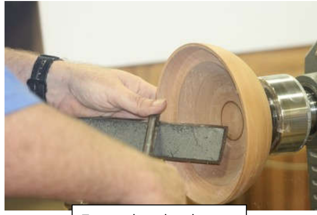
Turn and sand each stage