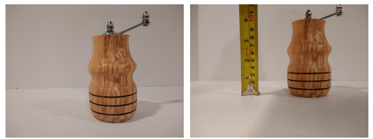
Mark Fields - Ambrosia maple wood for a pepper mill mini kit.