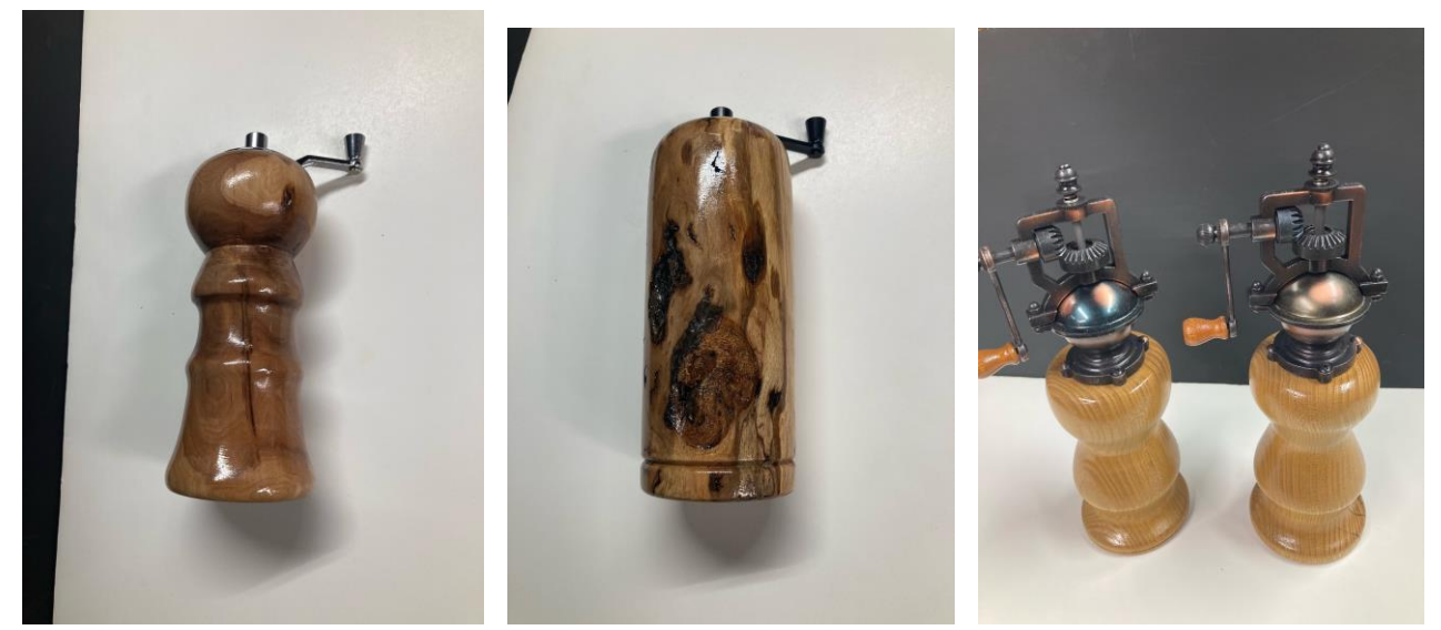
Rob Robinson- peppermills out of applewood, driftwood, and mulberry tree.

Tom Stevenson made a peppergrinder with recycled wood...redwood, maple, teak, walnut, cherry