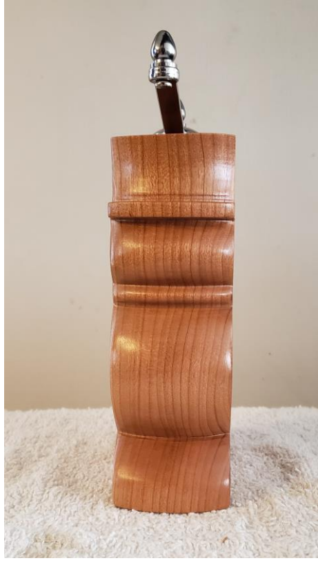
Joe Garofalo - See through inside-out snowman peppermill.