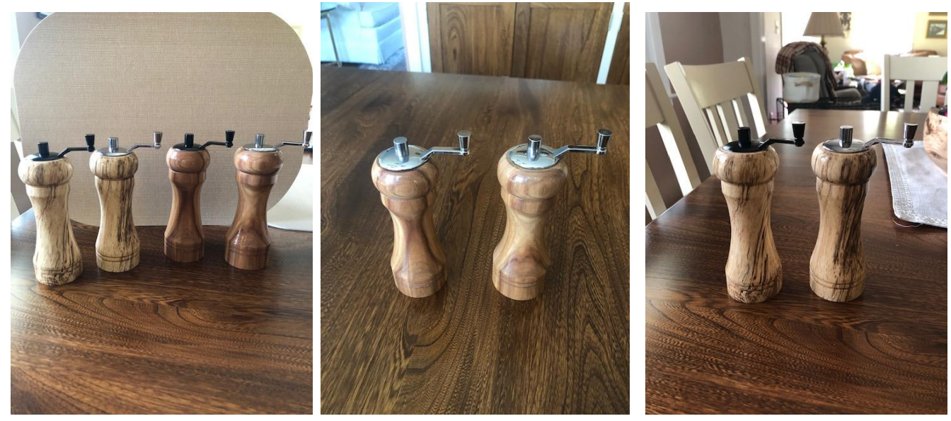
Dave made peppermills - 2 spalted maple & 2 hickory