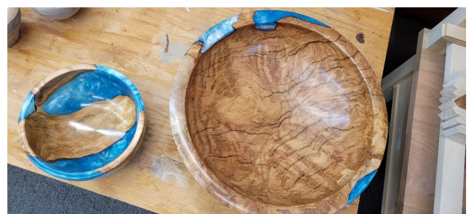
Dan Merlo - 2 maple burl bowls cast with blue resin.