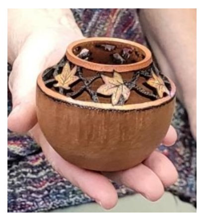
Lynda Zibbideo -- little seashell cutoffs, purple black peanut, and Spanish cedar small hollow form.