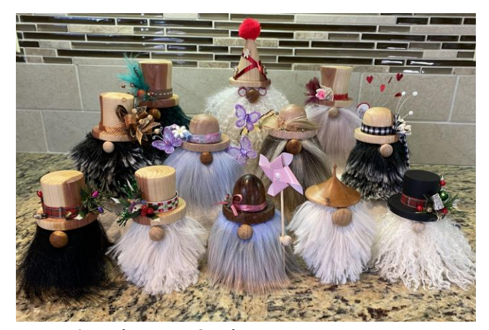
Lynda Z - Gonks