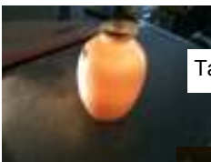
Tagua nut vase

Articles: Looking for articles that you want to share with your fellow CCW members. No computer...no problem, write it out & mail it to me.