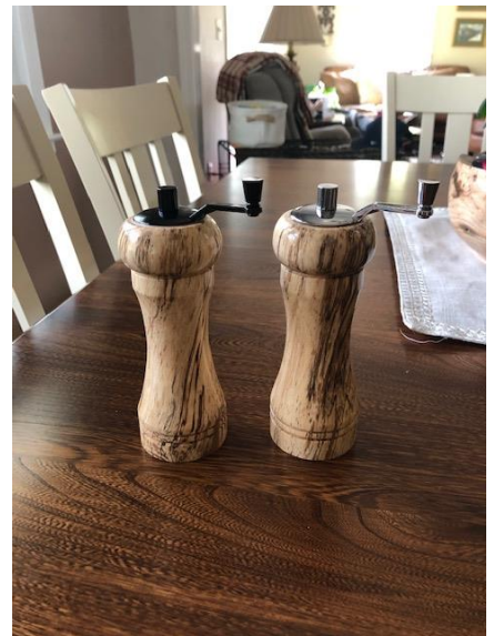
Dave made peppermills - 2 spalted maple & 2 hickory