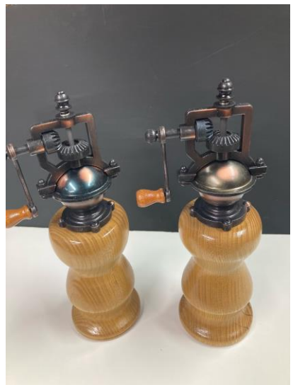
Rob Robinson- peppermills out of applewood, driftwood, and mulberry tree.