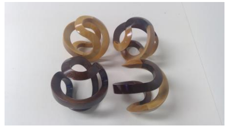
Kip Lockhart-Maple bowl (green wood) that turned oval, & walnut & alder streptohedrons