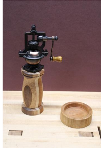
Tom Stevenson made a peppergrinder with recycled wood...redwood, maple, teak, walnut, cherry