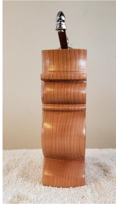
Joe Garofalo - See through inside-out snowman peppermill.