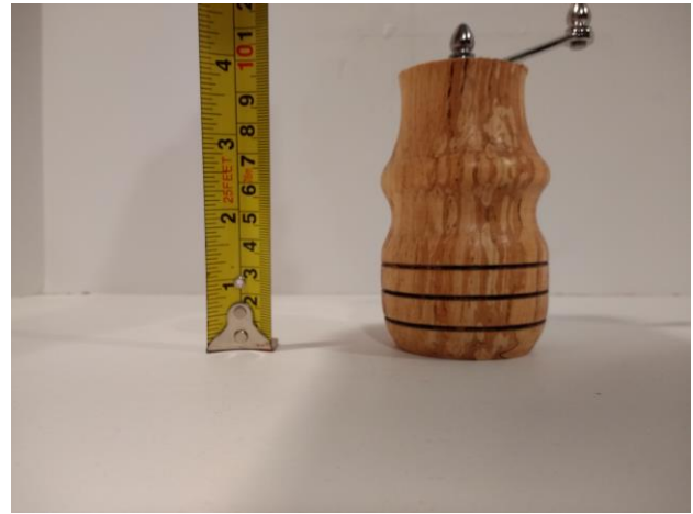
Mark Fields - Ambrosia maple wood for a pepper mill mini kit.