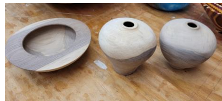
John Webber - Cored 3 maple bowls (2 weeks old green), & little walnut bowl and 2 little walnut hollow forms.