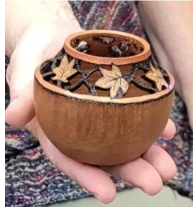
Lynda Zibbideo -- little seashell cutoffs, purple black peanut, and Spanish cedar small hollow form.