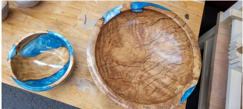
Dan Merlo - 2 maple burl bowls cast with blue resin.