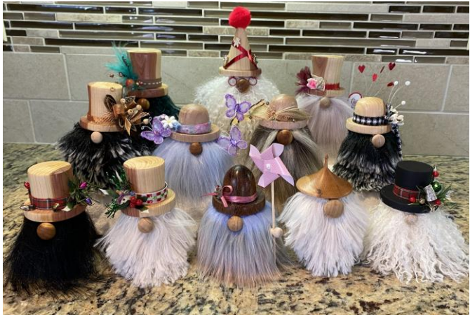
Lynda Z - Gonks