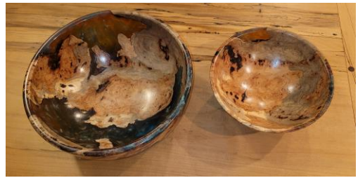
----- Dan Merlo -----