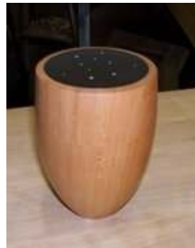
available from Crafts Supplies and Packard Woodworks.