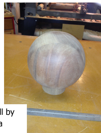
8" Mahogany Ball by Jim Kephart for a newel post